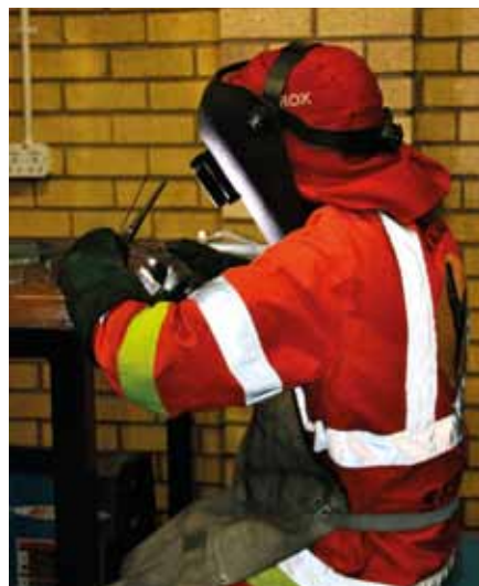
12 Investing in skills development