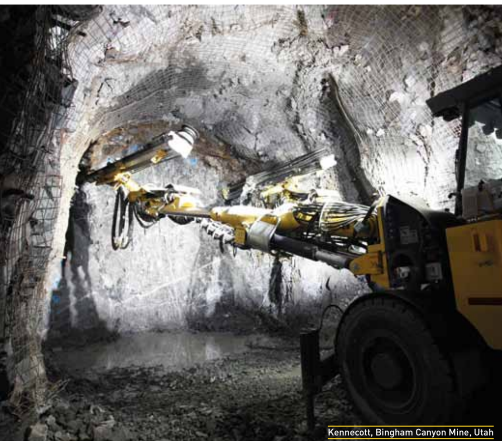
Kennecott, Bingham Canyon Mine, Utah

Another key part of the future of Cementation USA is the Eagle project for Lundin Mining in Michigan. This development project was awarded to the company in November 2013 and mobilisation commenced at the end of the calendar year. The work scope is substantial and has helped Cementation USA maintain a strong order book for the next few years. Top all that off with over 700 days with no lost time injuries, and this has been a banner year for Cementation USA.