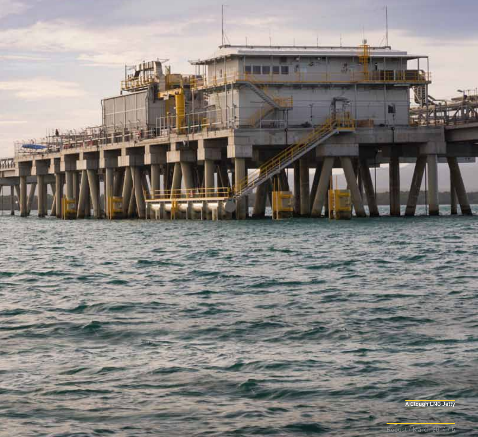
A Clough LNG Jetty