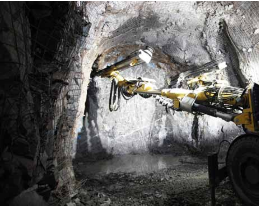
9 Underground Mining: Cementation Canada