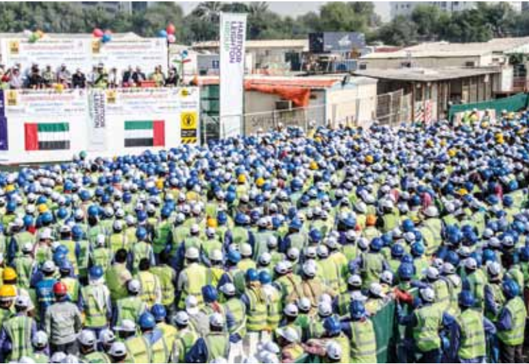
Al Mafrag Hospital: Employees mark 10 million man hours without LTI