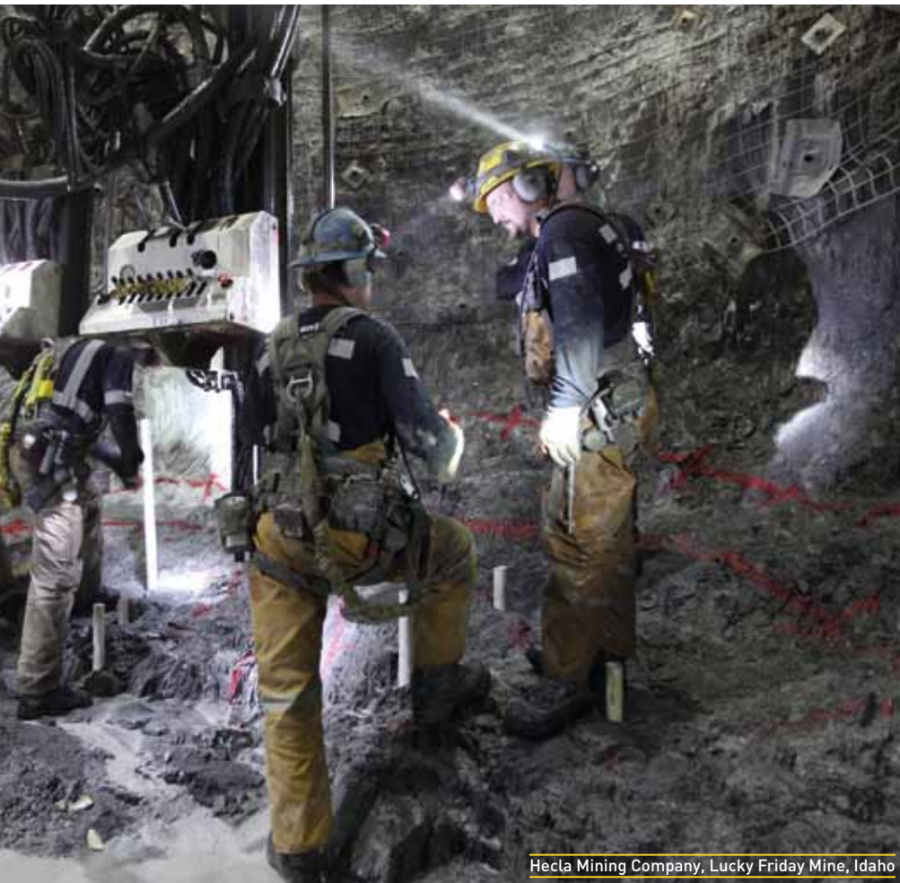
Hecla Mining Company, Lucky Friday Mine, Idaho

The financial performance of Murray & Roberts for the first six months of the year to 31 December 2013 reflects the full consolidation of Clough as a wholly owned subsidiary (as from mid-December 2013) and, in line with expectations, confirms that the Group is financially sound and is maintaining a positive earnings growth trend. This bodes well for an exciting new future.