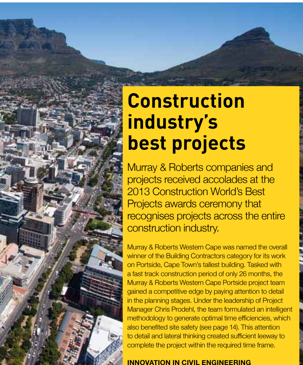
Portside Building (forefront), Cape Town's tallest building, completed in record time with a commendable safety achievement