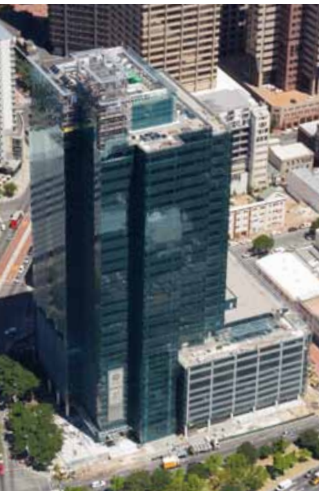
Cover Award winning Portside, Cape Town's tallest building