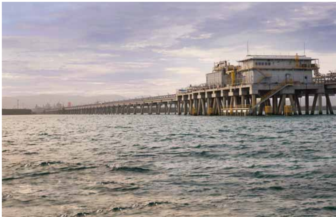
04 Oil & Gas: A Clough LNG Jetty