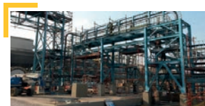
Tsumeb Sulphuric Acid Plant Client: Dundee Precious Metals Location: Namibia Scope: Electrical and Instrumentation