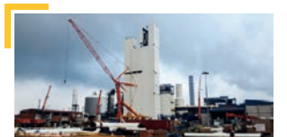
Sasol Secunda Client: Air Liquide Location: South Africa Scope: Electrical and Instrumentation