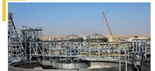
Husab Uranium Process Plant Client: Swakop Uranium Limited Location: Namibia Scope: Electrical and Instrumentation