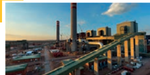
Medupi Power Station Client: General Electric Location: South Africa Scope: Electrical and Instrumentation