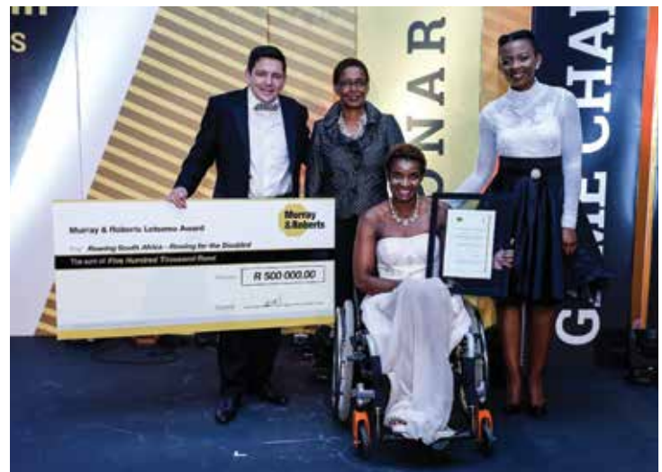
Letsema Award category winner: Rowing South Africa

Murray & Roberts currently has a total of 22 Jack Cheetham and Letsema beneficiaries supported, with a total of R1,5 million disbursed to these partners annually.